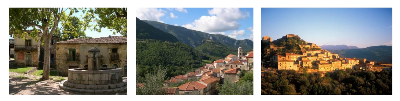
Please note: this is a moderately easy tour which is suitable for those who have some experience of walking and a good general physical condition. Most of the walks are on good paths, some of them just recently restored by the local authorities. Parts of the paths are waymarked. Elsewhere you have to follow the route notes provided together with the maps. Average walking times: from approx 4 to 6 hours each day.

At the beginning or the end of the tour there is also an opportunity to visit Paestum or Pompeii, or spend some time on the beach. The tour can easily be combined with a journey along the coast of the Cilento or with a tour on the Amalfi Coast.